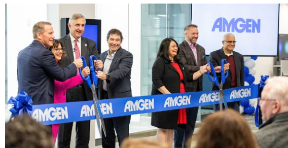
Amgen ribbon cutting courtesy of City of New Albany.