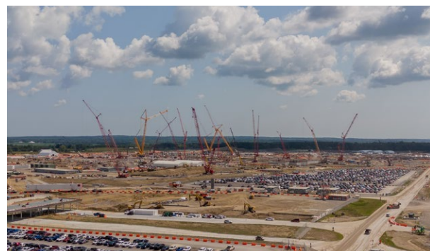
Ohio One construction photo courtesy of City of New Albany.

Throughout the summer, and with the help of Ohio state and local authorities, Intel transported four super loads from the Ohio River to the Intel Ohio One Campus in New Albany. Progress at the fabrication site continues, with one of the largest cranes in the world recently arriving to support the next phase of construction. Regular updates on the project can be found at NewAlbanySiliconHeartland.com .