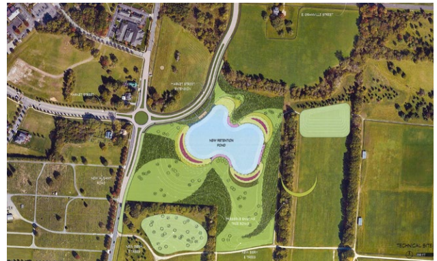
Extension of Market Street, new roundabout and water feature.