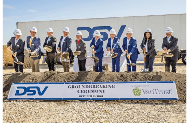
DSV groundbreaking courtesy of VanTrust.

Construction on the DSV Solutions 1.2 million s.f. facility began in late 2023 and is slated for completion in the first quarter of 2025. The new logistics facility is located in the New Albany Tech Park, which is under development by VanTrust. This new complex represents the largest DSV Solutions facility in North America and is the largest industrial building in New Albany. The Denmark-based transport and logistics company will create 300 jobs here, providing essential support for customers in the semiconductor industry.