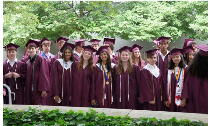
New Albany graduates courtesy of New Albany-Plain Local Schools.

I hope you will join me in voting FOR Issue 40 to fund the essential projects as outlined in the 2024 Campus Master Plan.