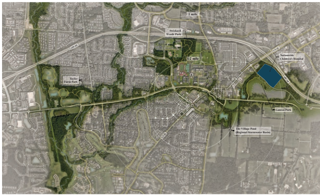
New Albany's emerald necklace.

New Albany Company also recently announced a contribution of land and planning services to support the development of a new roundabout at the extension of Market Street and State Route 605. Working with the City, we've developed plans for a beautiful water feature with wetland plantings and a scenic overlook for public enjoyment. This new public amenity extends New Albany's "emerald necklace," a series of planned parks and green space that extends from one end of the community to the other.