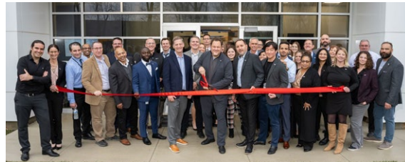
AmplifyBio grand opening celebration

Amgen, Pharmavite and AmplifyBio represent a significant step forward in the growth of life sciences in the Business Park and the further diversification of the industries driving New Albany’s economic growth. And like so many other companies in the park, they have engaged in the community by supporting community organizations and the schools.