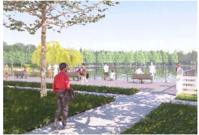
Scenic overlook rendering courtesy of Realm Collaborative.