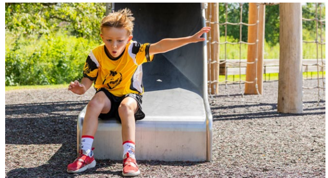
Taylor Farm Park.