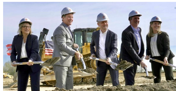
Pharmavite groundbreaking courtesy of City of New Albany.