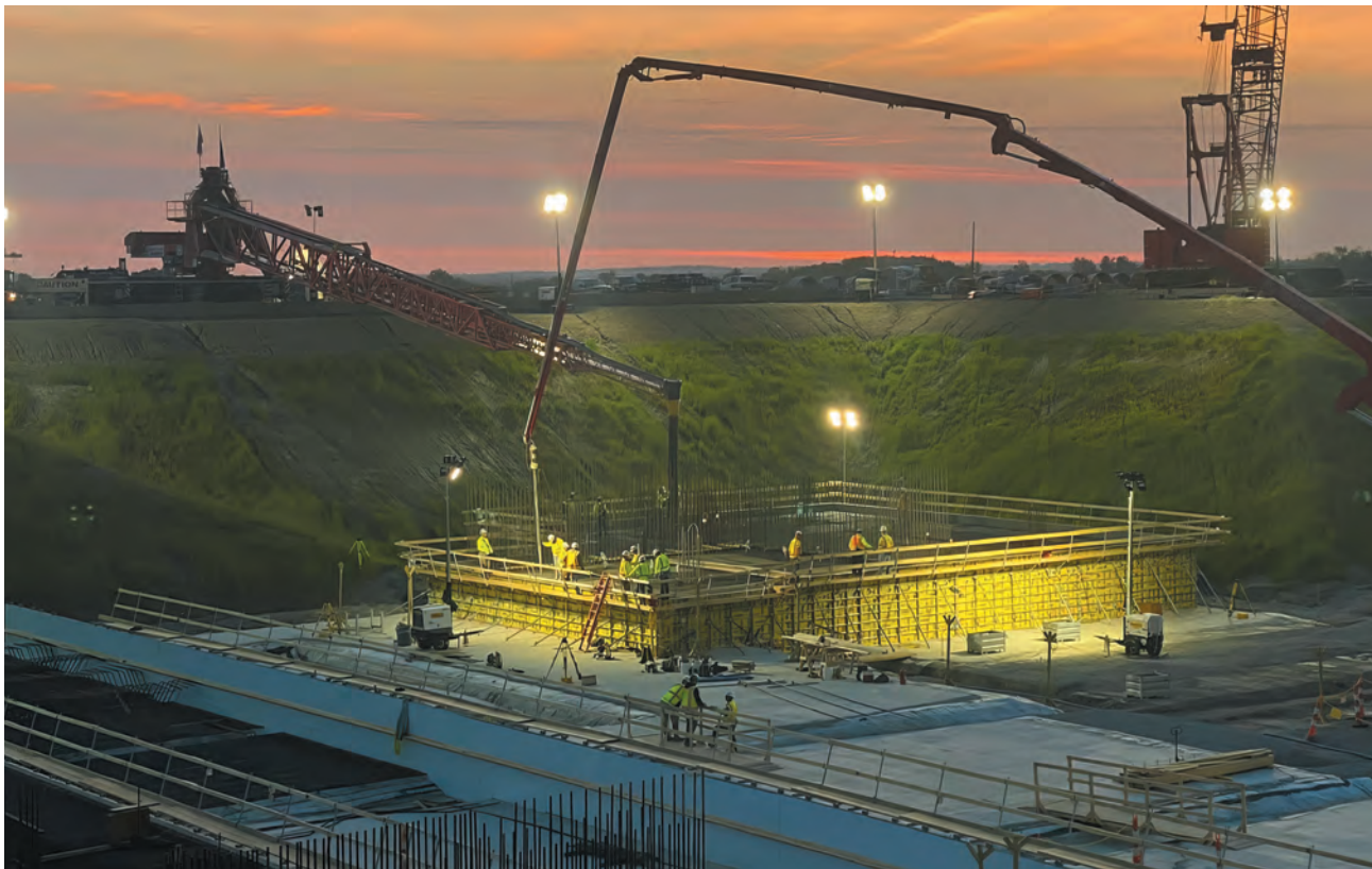
Intel's Ohio One construction teams began the concrete pour in May of this year.