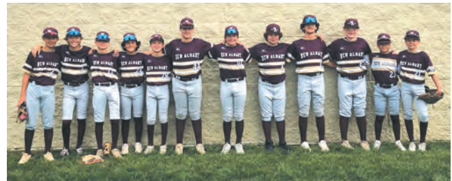
Great Lakes Regional Champions, New Albany Little League 12U All-Stars Baseball Team