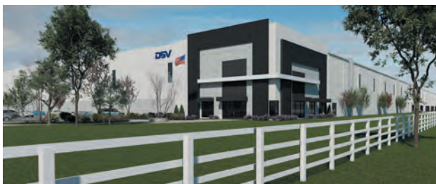
Global transport and logistics firm DSV recently broke ground on a new 1.2 million sq. ft. building in the New Albany Tech Park, a section of The New Albany International Business Park under development by VanTrust Real Estate.

Columbus CEO featured New Albany in a special section this summer and you'll find it enclosed. We are particularly pleased the piece featured Amgen, a global pioneer in restoring health and providing therapies for those fighting serious illnesses. Amgen is expected to open in the Business Park before the end of the year and expects to create 400 new jobs in its first phase of operation.