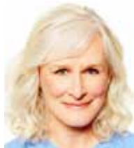
Glenn Close Actress and Mental Health Advocate