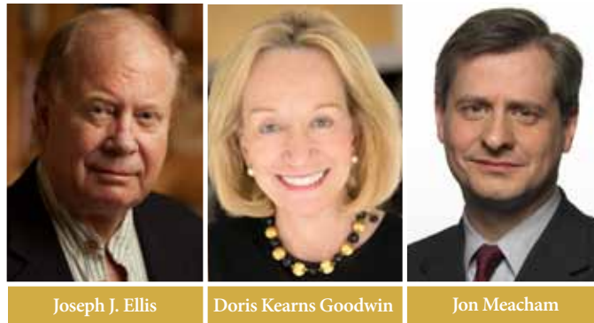
Joseph J. Ellis

featuring three Pulitzer Prize-winning Historians