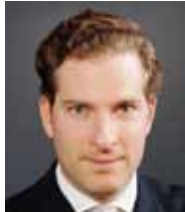
Noah Feldman Harvard Law Professor and Author