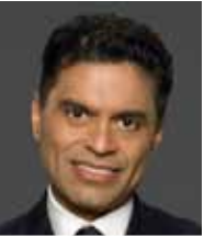
Dr. Fareed Zakaria Moderator