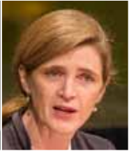
Samantha Power Former U.N. Ambassador