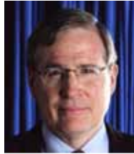
Stephen Hadley Former U.S. National Security Advisor