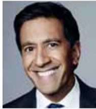
Dr. Sanjay Gupta Emmy Award-winning Chief Medical Correspondent for CNN and Neurosurgeon