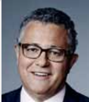
Jeffrey Toobin CNN Senior Analyst and Bestselling Author