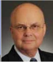
General Michael Hayden Former Director of the CIA and the National Security Agency